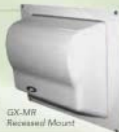
GX-MR Recessed Mount

A RECESS KIT is available to reduce the depth of the dryer to less than 4" from the surface of the wall on all models.