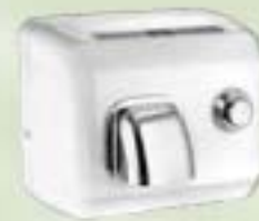
DR-N Series White Push Button