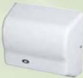
GX Series White