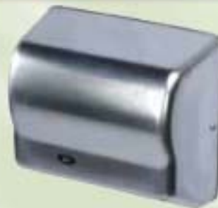
GX-C Series Chrome

A RECESS KIT is available to reduce the depth of the dryer to less than 4" from the surface of the wall on all models.