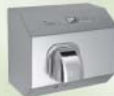
DR-TN55 Stainless Steel Automatic

THE DR SERIES HAND & HAIR DRYERS' TIME-TESTED DESIGN FEATURES QUIET, DEPENDABLE OPERATION IN A HEAVY DUTY, VANDAL-RESISTANT PACKAGE.