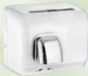
DR-TN Series White Automatic

Maintenance free Quiet, dependable operation 360° revolving nozzle Vandal resistant Durable finish-looks new for years 10 year limited warranty