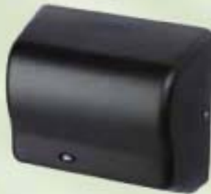
GX-BG Series Black Graphite